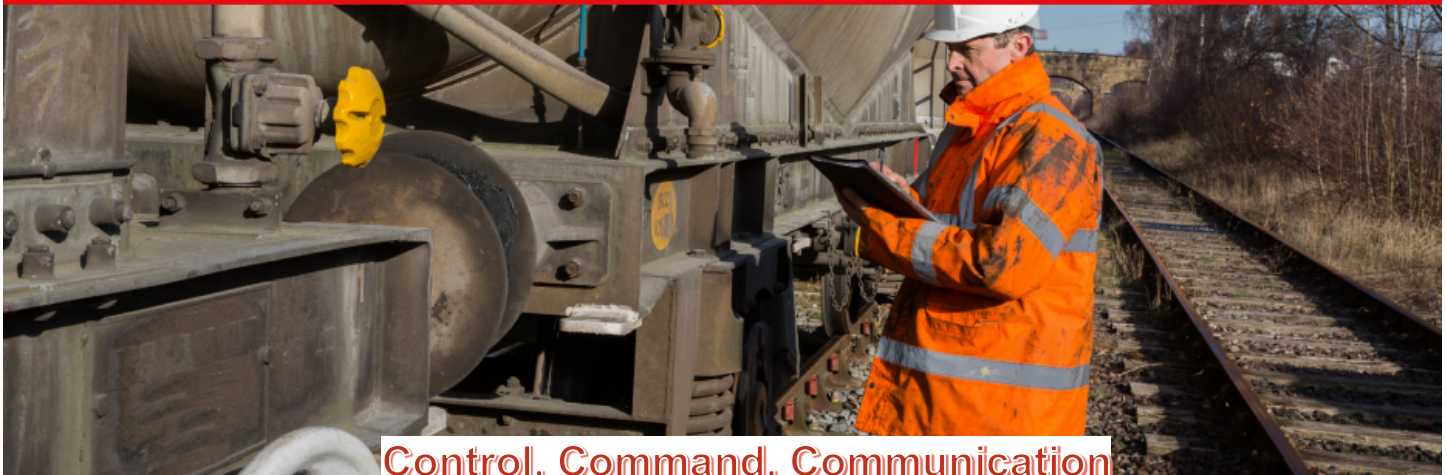
Control, Command, Communication

In September 2022, one new standard has been published in the standards catalogue. RIS-0745-CCS Issue 1 – which also includes any updates or changes. After a detailed review, no amendments to Sentinel skills and compliance are required.